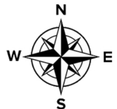
Diagram Not Drawn to Scale