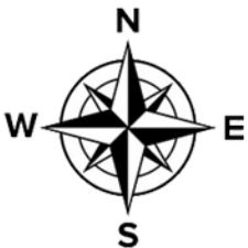
Diagram Not Drawn to Scale