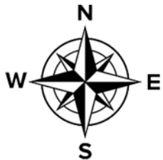
Diagram Not Drawn to Scale