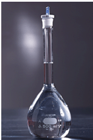
Example of a 500 mL Volumetric Flask