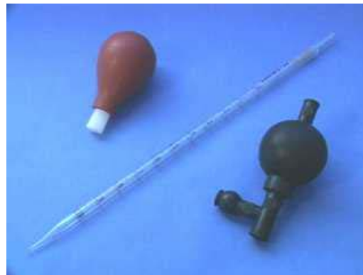
Graduated Pipet & Pipet Bulbs