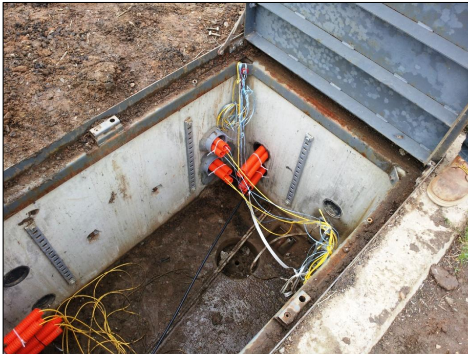
Data Pull Box with Installed Innerduct