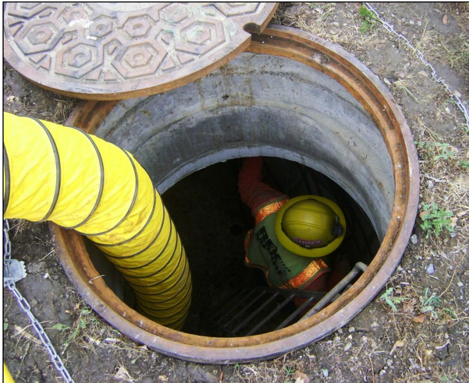
Campus Communications Vault