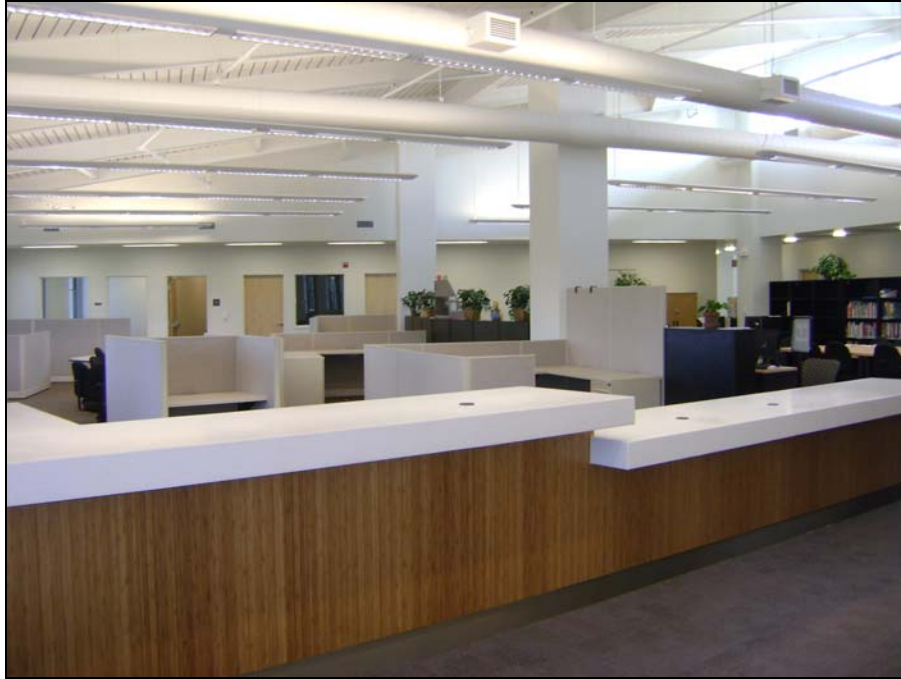
Reception Counter and Furniture at WorkNet / CTC