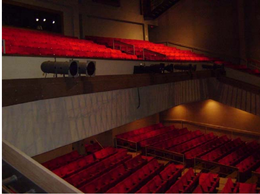
Atherton Theatre – Partial View of Completed Work