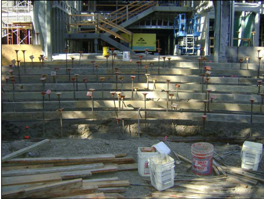
Forming Main Entry Stairs