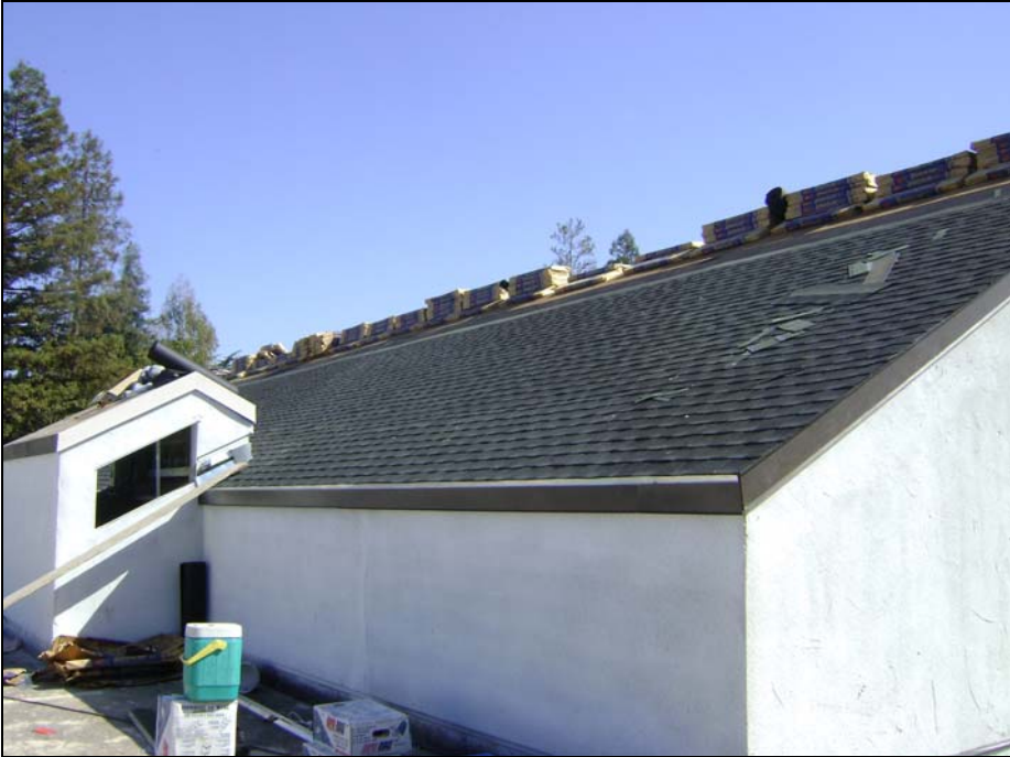
Installation of Composition Roofing