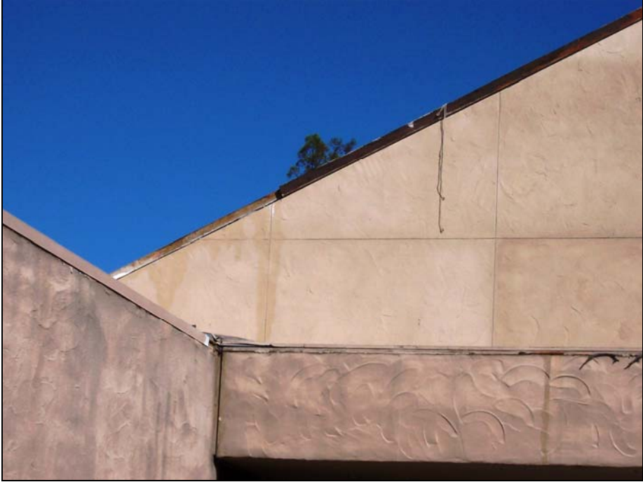
Final Coat of Plaster at Roof (Upper Portion of Picture)