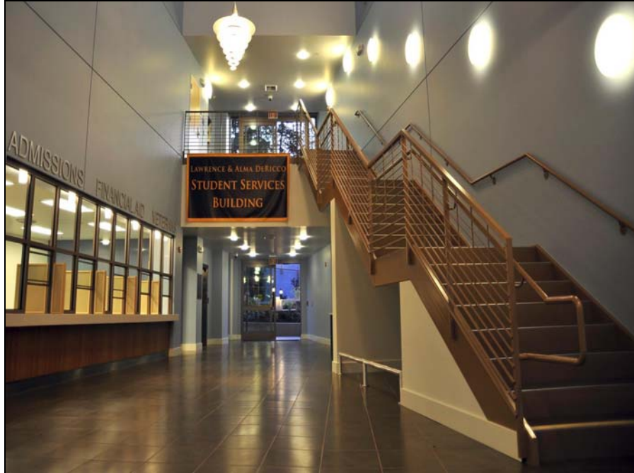
South Lobby / Service Window