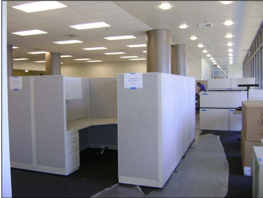
Modular Furniture at Admissions Dept.