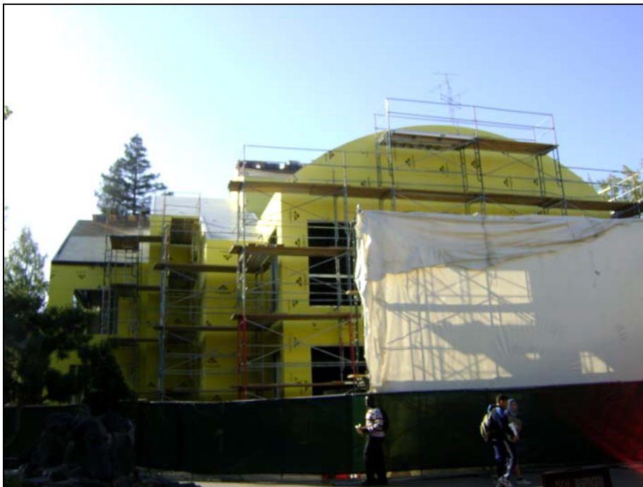
Completion of Exterior Gypsum Wallboard