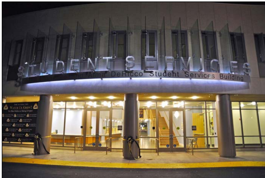
Main Entry at Night