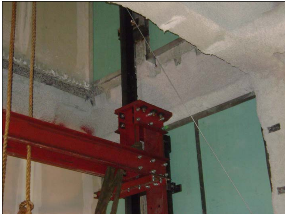
Elevator Guide Rails and Structural Support for South Elevator Cab