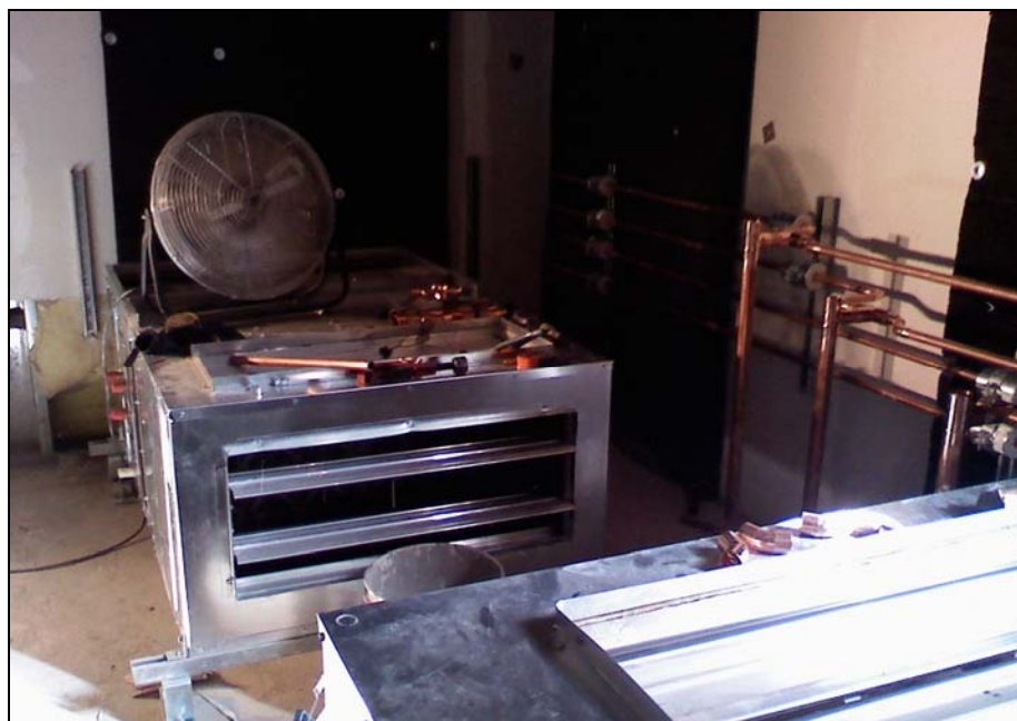
Installation of Mechanical Units