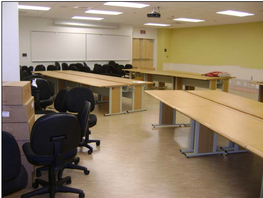
Furniture at Assessment