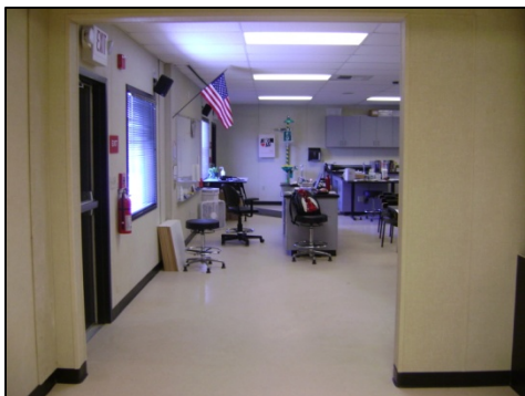
Portable 303A/303 Built Opening