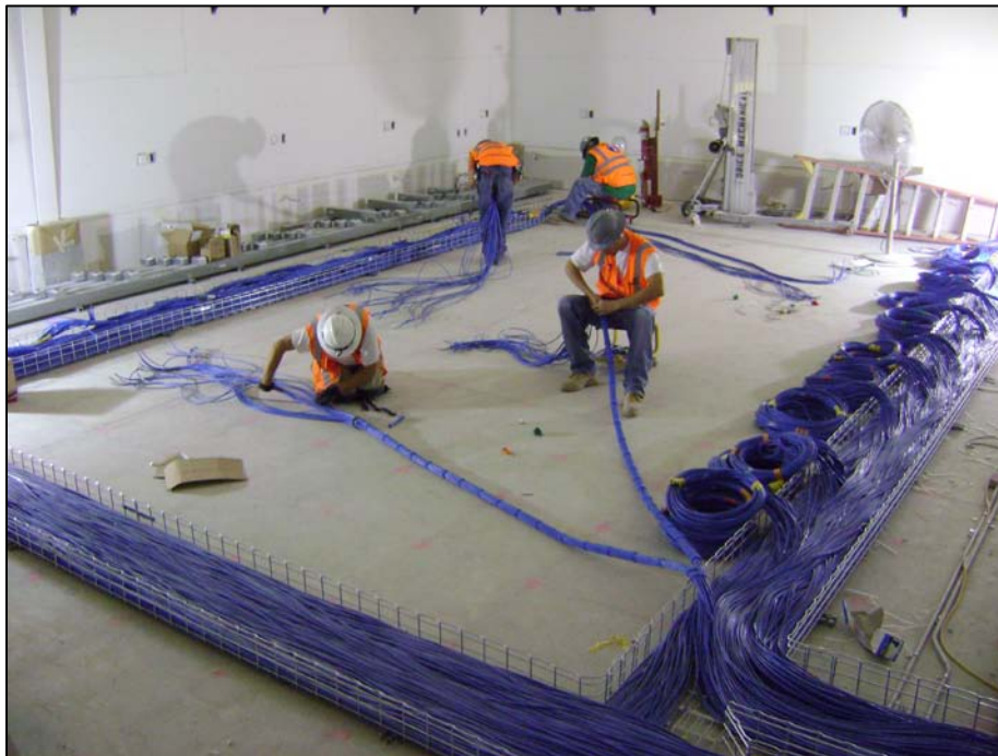
Telecom Equipment Room