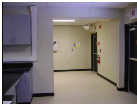
Portable 303/303A Built Opening