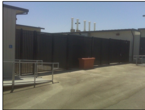
West Side Metal Fence - Outside