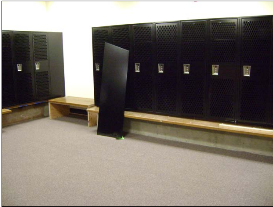
Women's Team Room