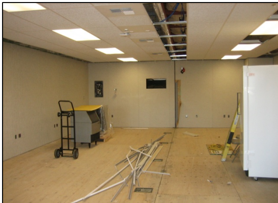
Portable 403 Interior Demo Start