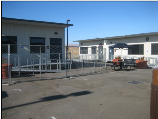
Construction Fence in place