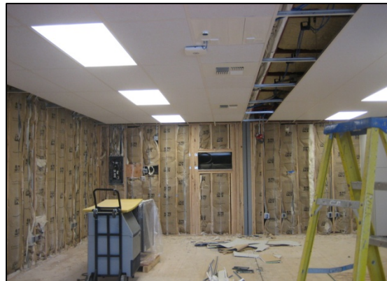
Portable 403 Sheetrock & Tack board Demo