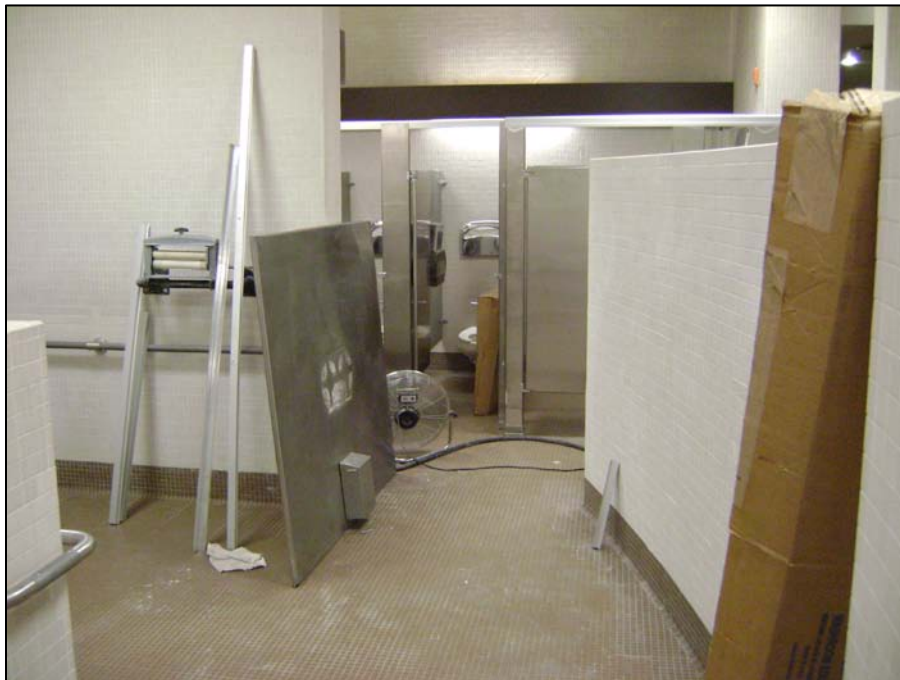
Women's Shower Area