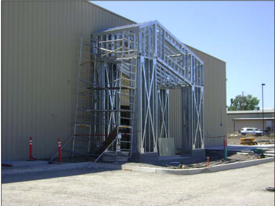
Entrance Canopy Framing