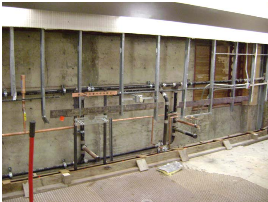
Men's Coaches Plumbing Wall Construction