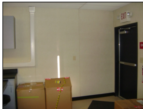
Portable 303 Wall Pre-Demo Photo