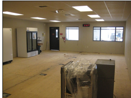
Portable 403 Pre-demolition photo