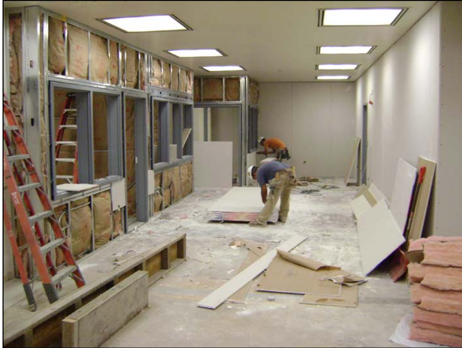
New Training Room Construction