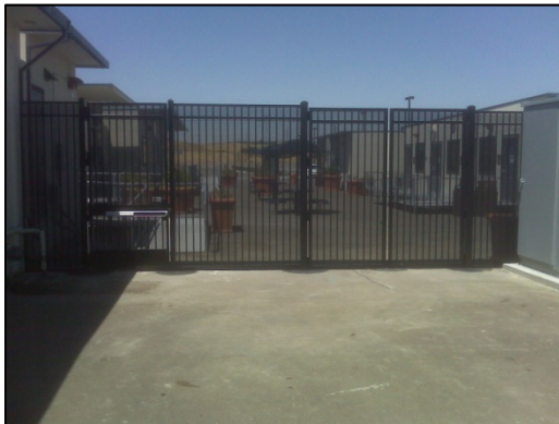
West Side Metal Fence – Inside