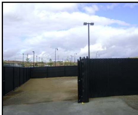
Chain Link fencing around service yard