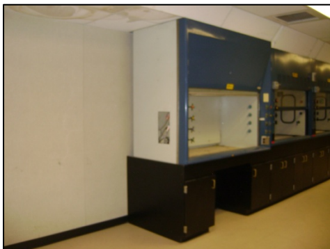
Portable 303A Wall Pre-Demo Photo