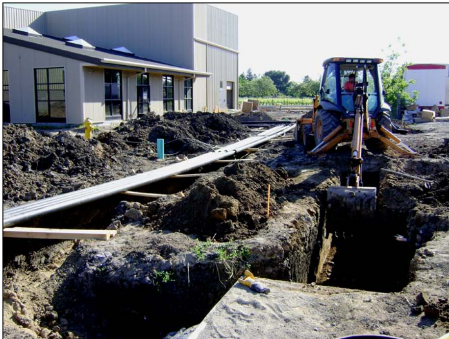
Generator Yard Excavation