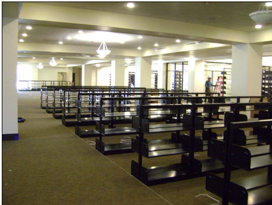
Library Shelving is substantially completed