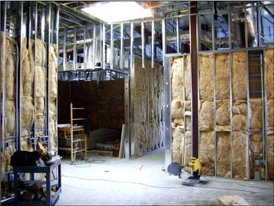
Customer Services Area