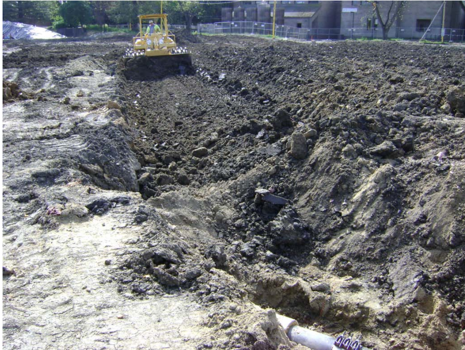
Compaction and grading of excavated building pad located at Building Wing A.