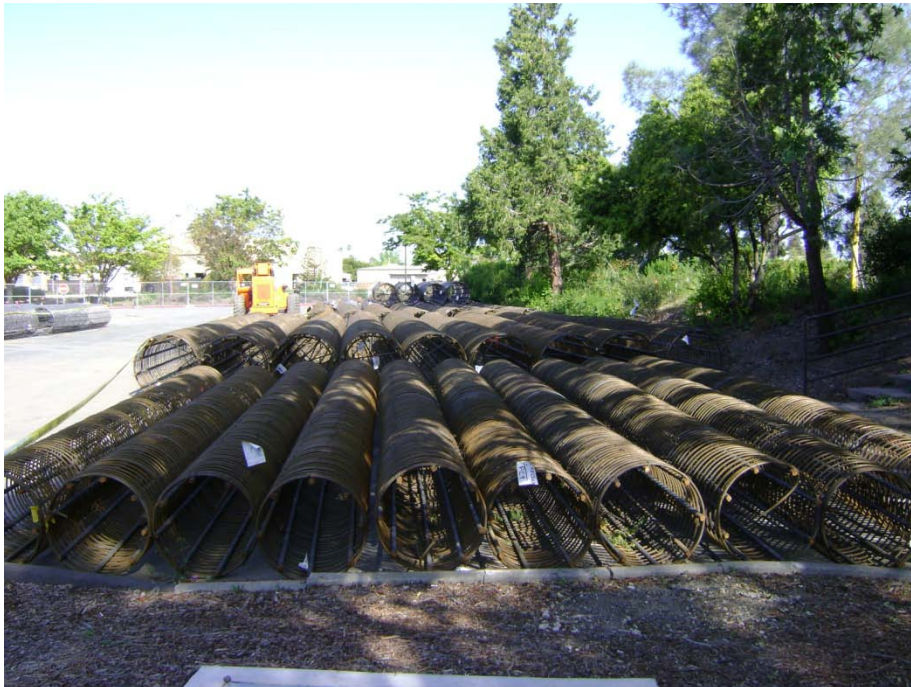
Rebar drilled pier cages fabricated and delivered to the site for Building Wing A