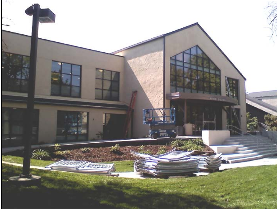
Landscape and Canopy are completed