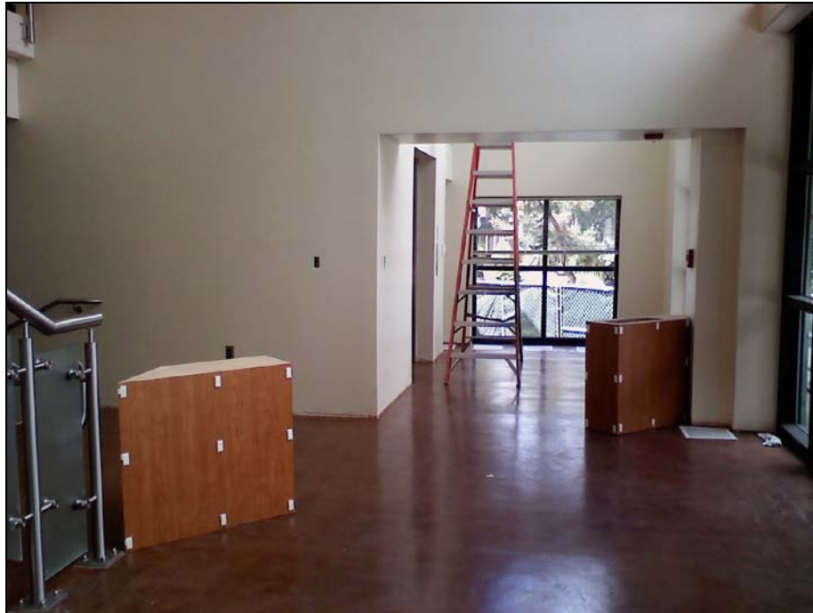
Lobby Floor receives stain