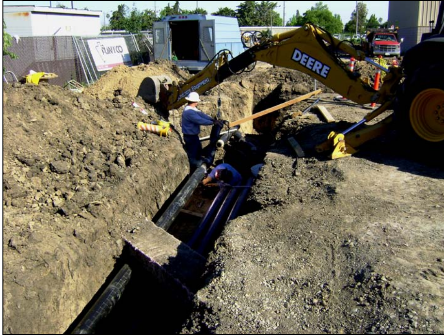
Hydronic Piping Installation