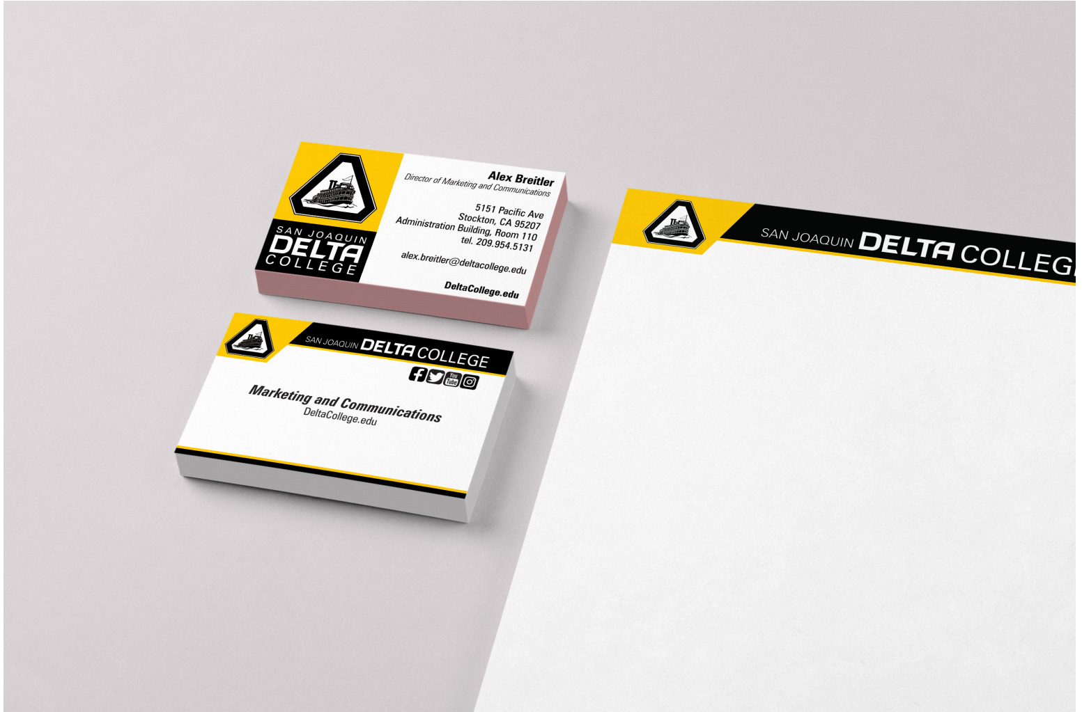
Business Card & Letterhead