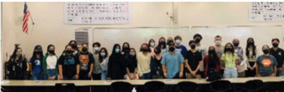
Epic Learning Community Students, Cohort 7 (2021-22)